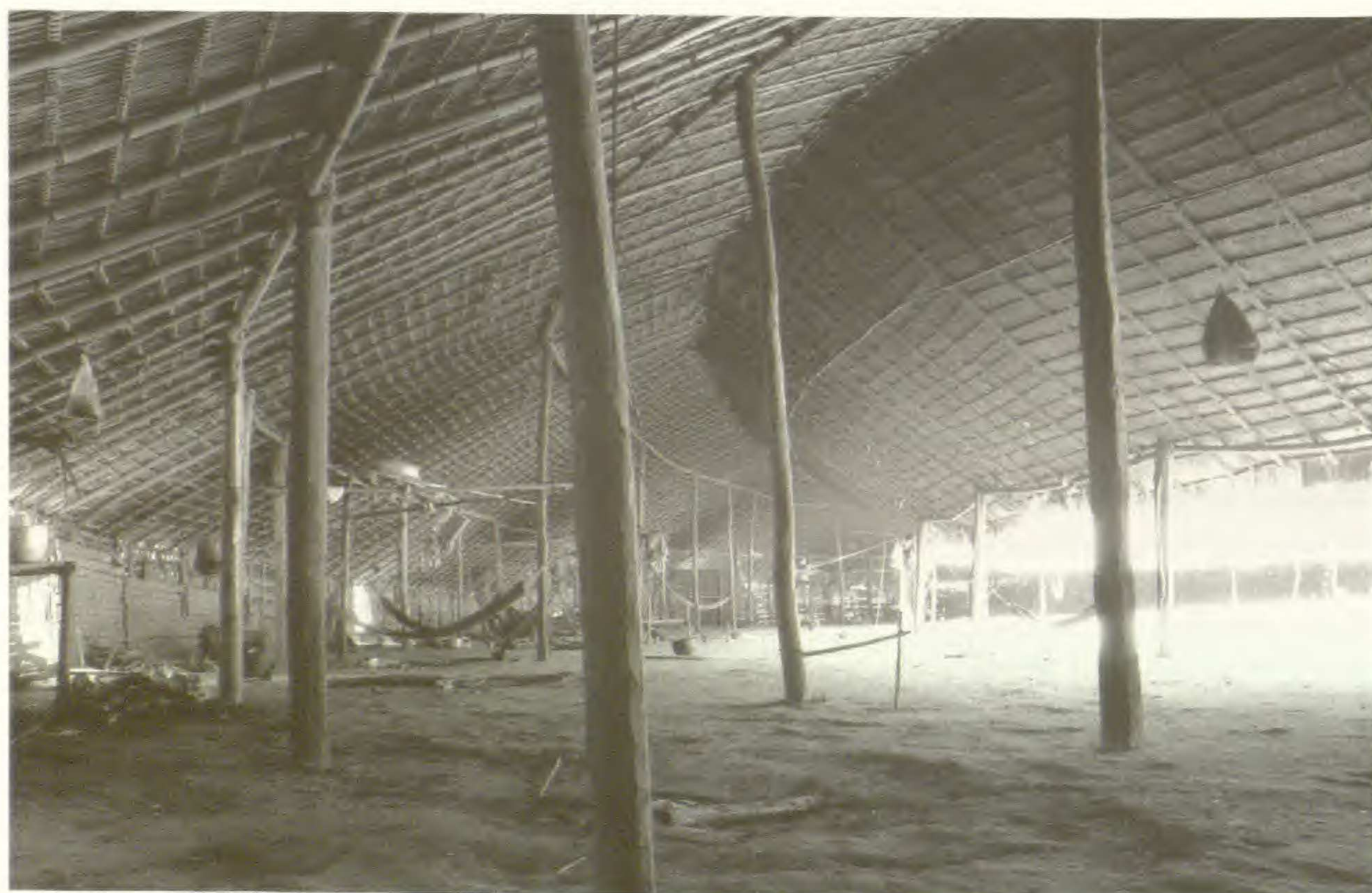
FIGURE 2.—Interior of the Watoriki round-house, with the opening to the central "plaza" on the right, and the outer wall on the left.

Detailed drawings and photographs were made of the construction details of the yano . Each of the categories of components was numbered, and their Yanomami names were recorded. A systematic quantitative survey of the names of the plants used to make each of these components was then conducted, category by category. From these data, a single list was composed of the Yanomami names for all of the plants employed in the construction of the yano . These plants were then collected in the surrounding forest (with Antonio Yanomami), and their names and uses were double-checked by consensus with at least one other resident in the village. Voucher specimens were kept, initially preserved in 70% alcohol (Schweinfurth method). These specimens, where fertile, have been lodged in the herbaria at Boa Vista (MIRR), Manaus (INPA), Kew (K), and New York (NY). Sterile voucher specimens are maintained at Kew only.